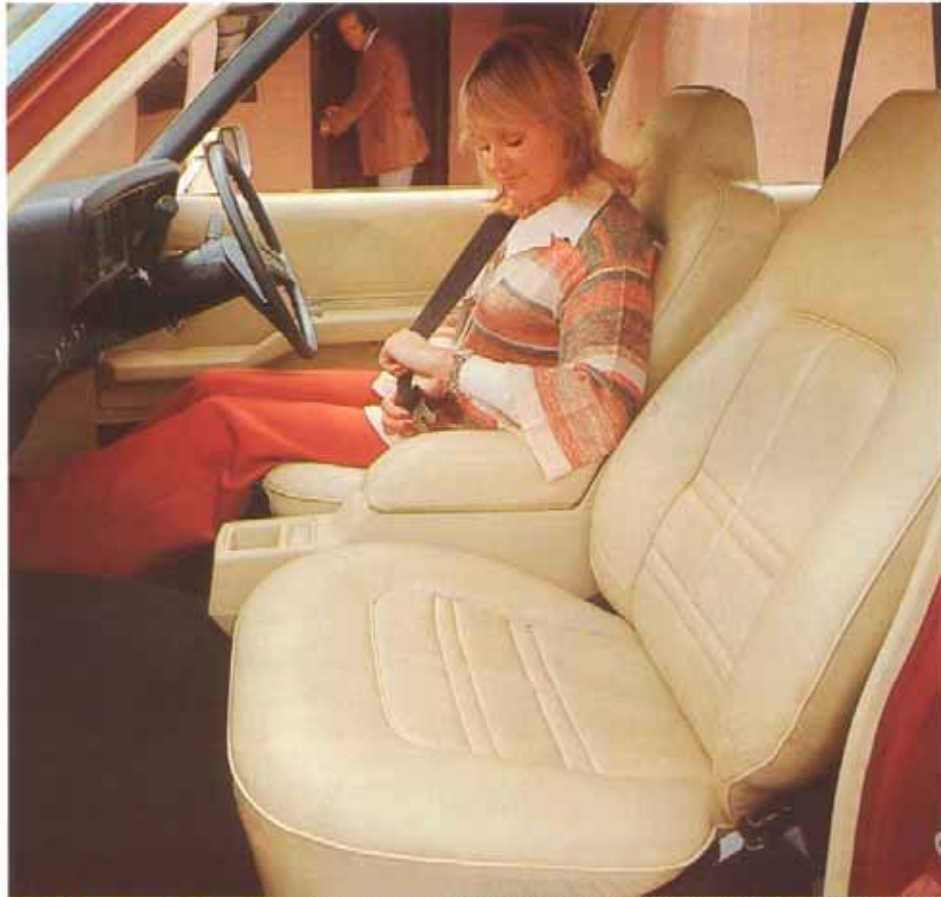
Resilient full foam front seats contour themselves to your body's contours for long-distance comfort and support. (Bucket seats standard on Premier Wagon.)