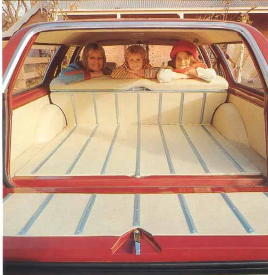
Out back, your Holdi Wagon offers a lot more than family room. It's an inner space vehicle that's ready to pack up and go.