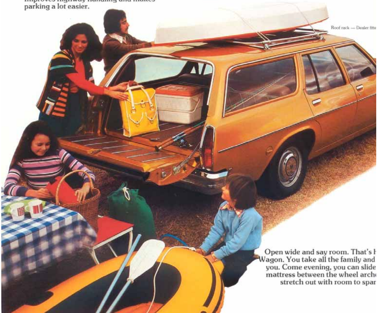
Roof rack — Dealer fitted

Holden's long wheelbase puts a lot of comfort between you and the road. Forward-mounted steering makes handling positive and precise. The steering ratio has been increased, too. Improves highway handling and makes parking a lot easier.