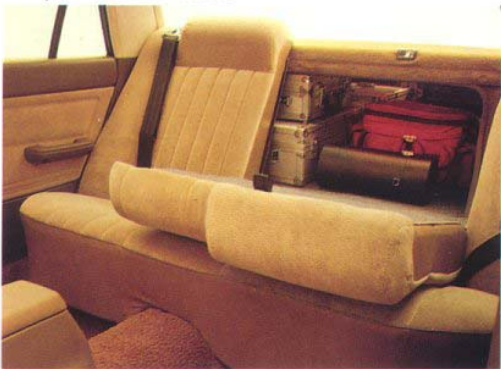
Split fold down rear seat — All models