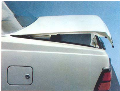
Remote boot release — Deluxe and Super Deluxe