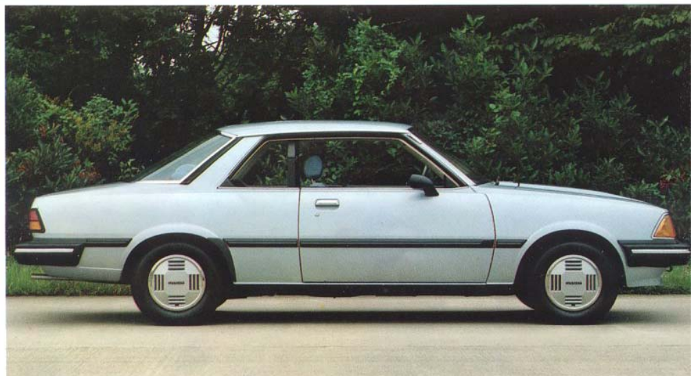
Super Deluxe Coupe

Equipment available ranges from the practical to the luxurious and always there is the assurance of Mazda High Value Engineering and Mazda Quality.