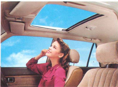
Electric sunroof — Super Deluxe Sedan