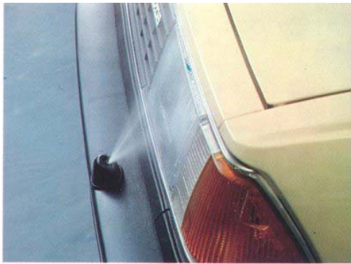
Quartz halogen headlights and washers — Super Deluxe models