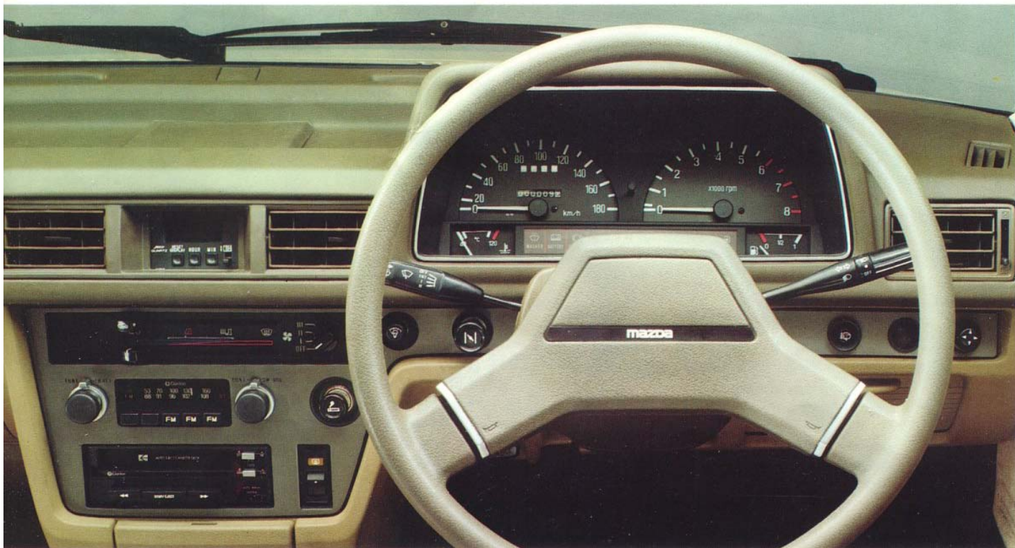
Dashboard — Super Deluxe Sedan