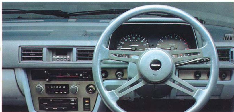
Drivers controls — Super Deluxe Coupe with four spoke sports steering wheel