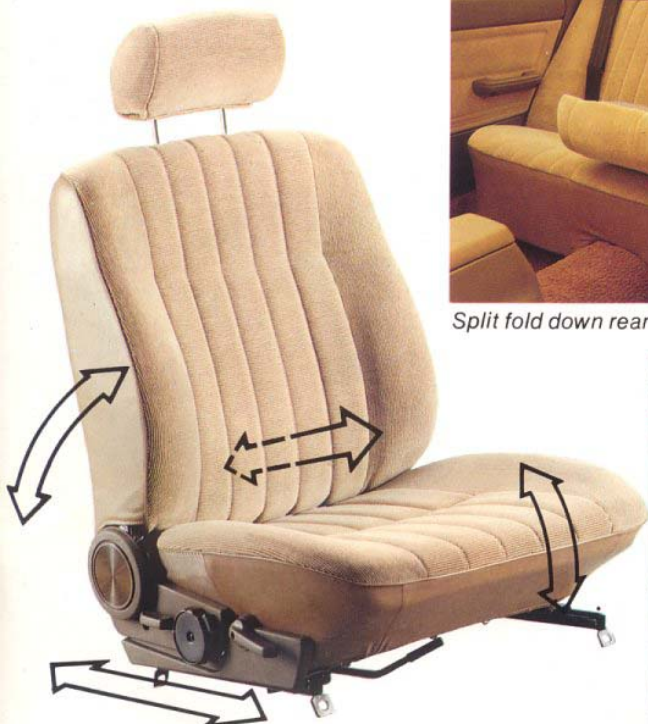
Four way adjustable drivers seat — All models