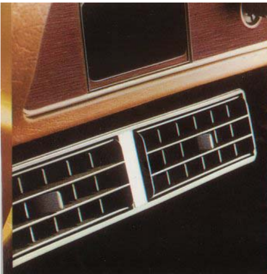
2-speed fan-booster ventilation