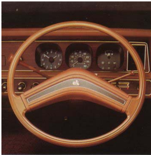
Safety padded steering wheel. Woodgrain finish dash.