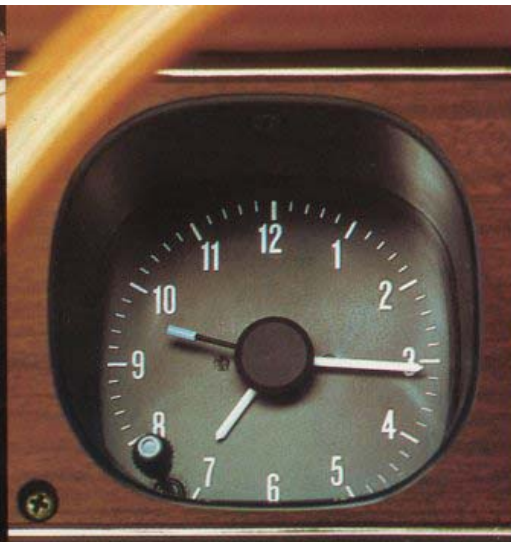
Clock with sweep second hand.