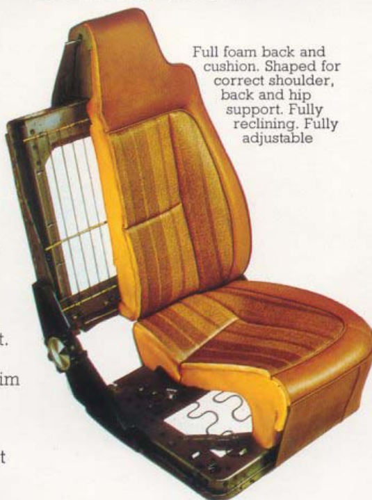
Full foam back and cushion. Shaped for correct shoulder, back and hip support. Fully reclining. Fully adjustable

Safety is built into every Torana SL. Like new, stronger bumper bars, front and rear. With rubber bumper strips that absorb small bumps without damage.