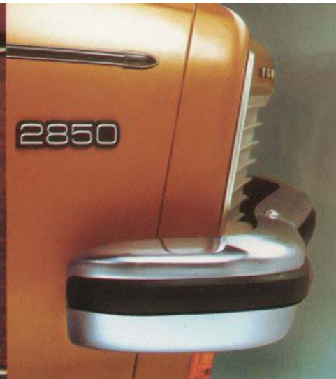
Rubber bumper inserts.

Power is converted by a smooth 3-on-the-column all-synchro change, or the popular Tri-matic 3-speed automatic. And matched by 10" (254 mm) disc brakes. Rally-tuned handling begins with a new wider, 55" (1397 mm) track and precise rack and pinion steering. Four-coil suspension has increased vertical travel for a smooth, big-car ride.