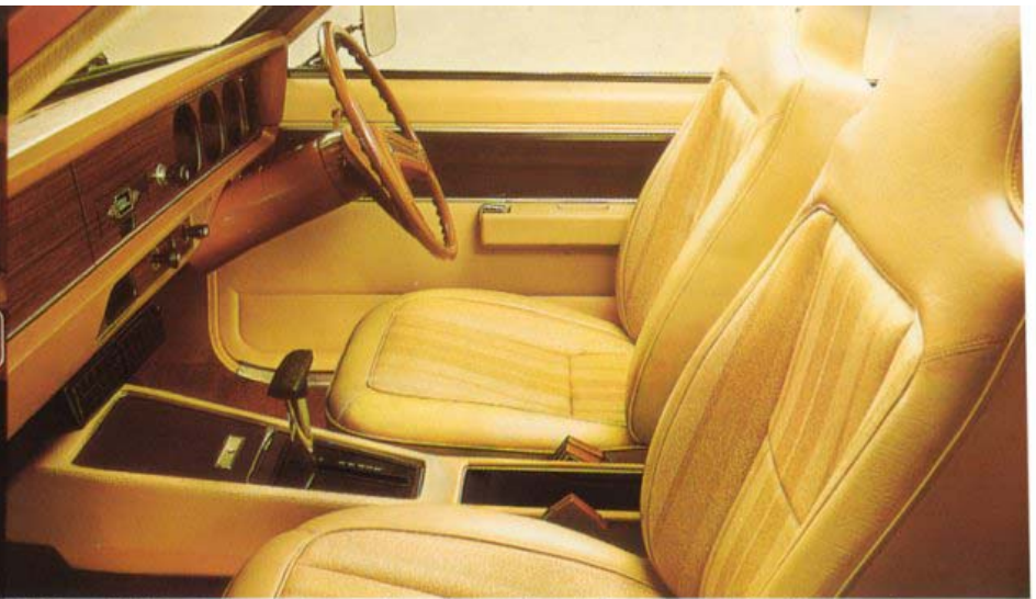
Full foam bucket seats with integral head restraints. (T-bar auto. option illustrated)