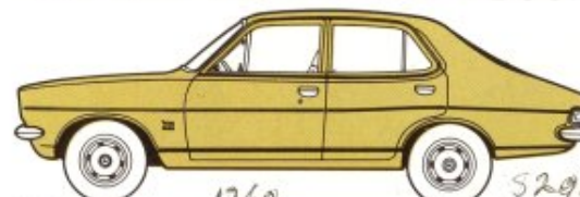
'1300' AND '1600' DELUXE 4 DOOR