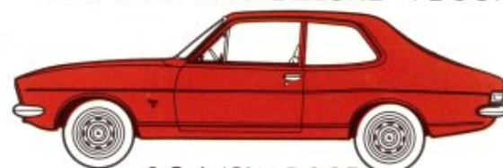
6 Cyl. 'S' 2 DOOR