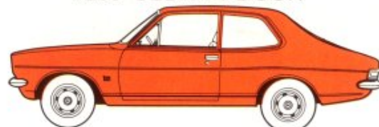
'1300' AND '1600' DELUXE 2 DOOR