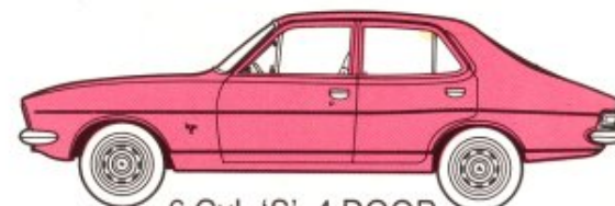
6 Cyl. 'S' 4 DOOR