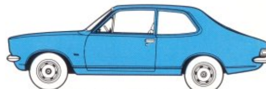
'1200' SEDAN 2 DOOR

PLEASE NOTE: As the policy of General Motors is one of continual improvement, all specifications and equipment are subject to change without notice.