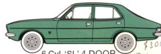
6 Cyl. 'SL' 4 DOOR