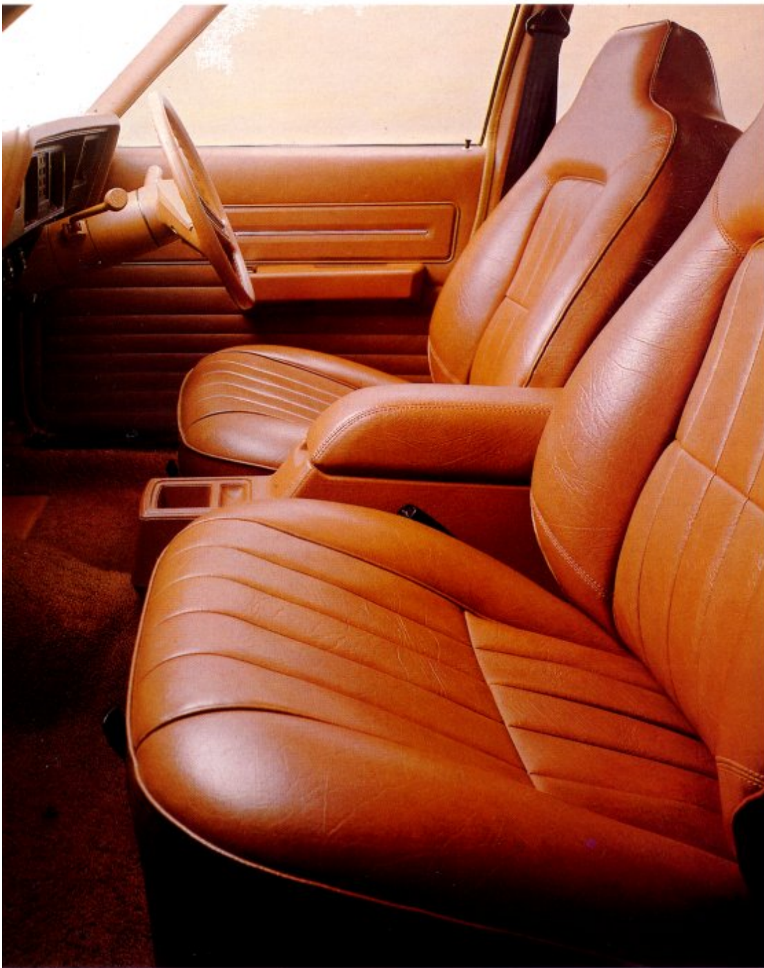
Inside Kingswood SL: Relax in the lap of luxury.

Kingswood SL with Radial Tuned Suspension. Peace and quiet with peace of mind.