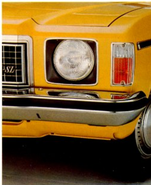
Quartz halogen headlamps, rubber bumper inserts.