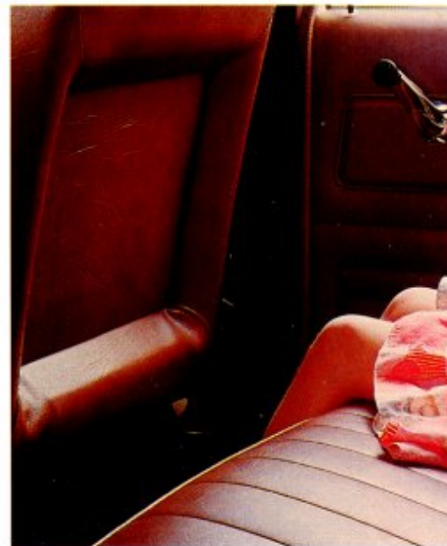
Recessed front seats for more rear passenger leg room.