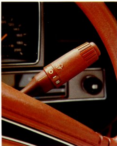
Multi-function control stalk.