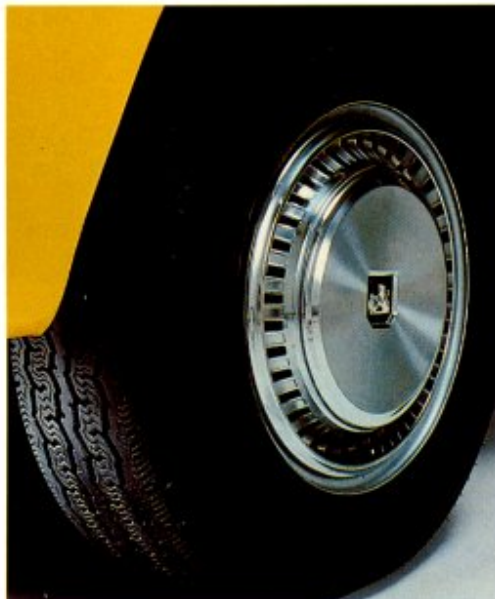
Steel-belted radials and full wheel covers.