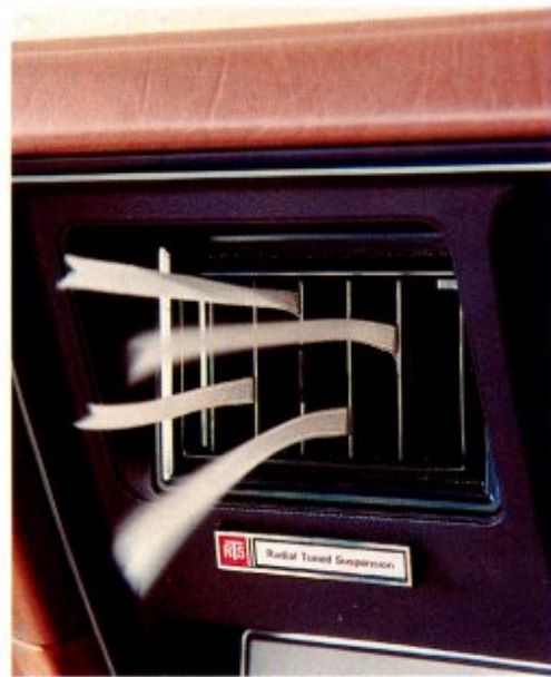
Two-speed, fan-boosted ventilation.