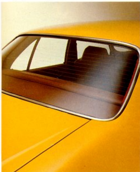
Electric rear window demister. (Sedan model.)