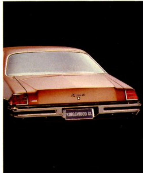
Distinctive rear deck styling.