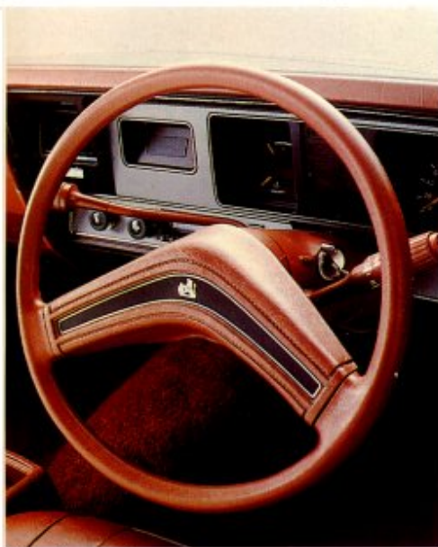
Soft-grip steering wheel.